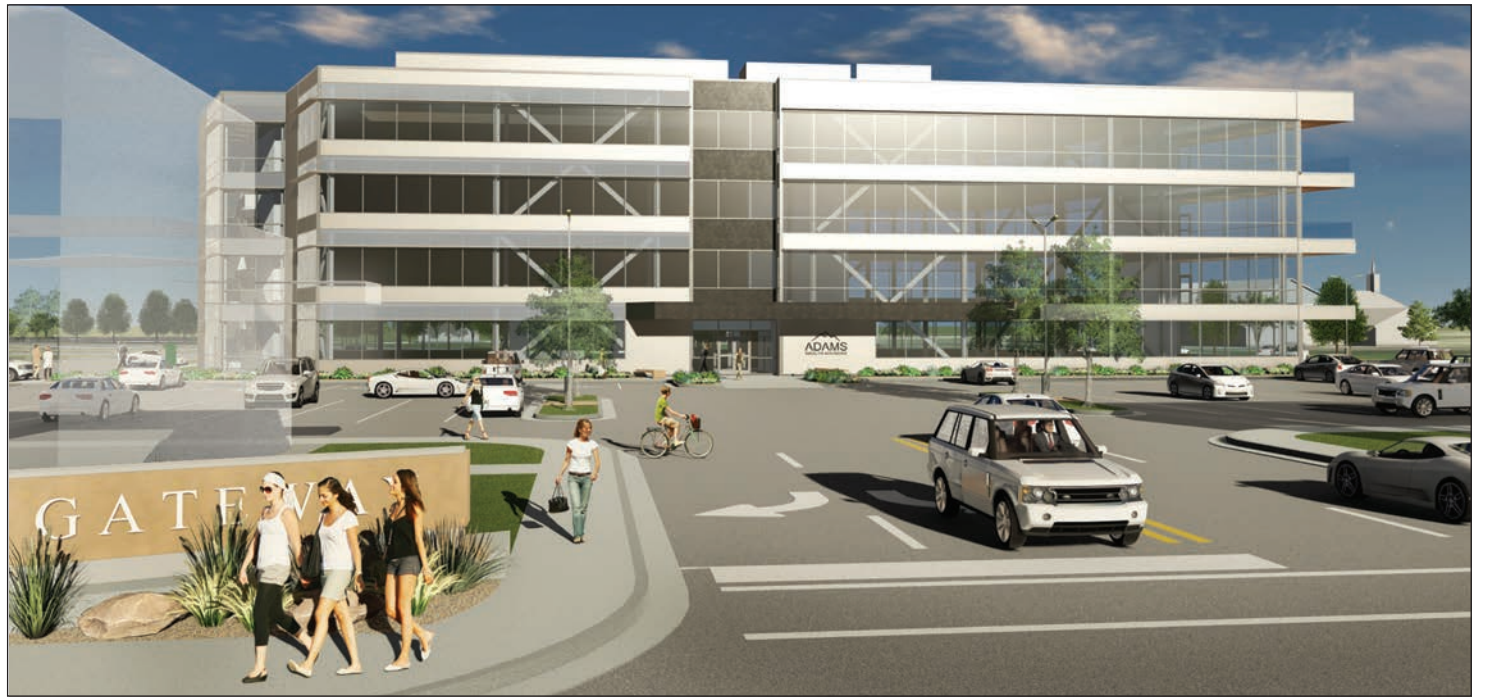
This four-story office building in a new eight-acre commercial development on Main Street in the south end of Logan will house several companies, according to developers.

Development continues along Logan's South Main Street, with two key projects nearing comple-