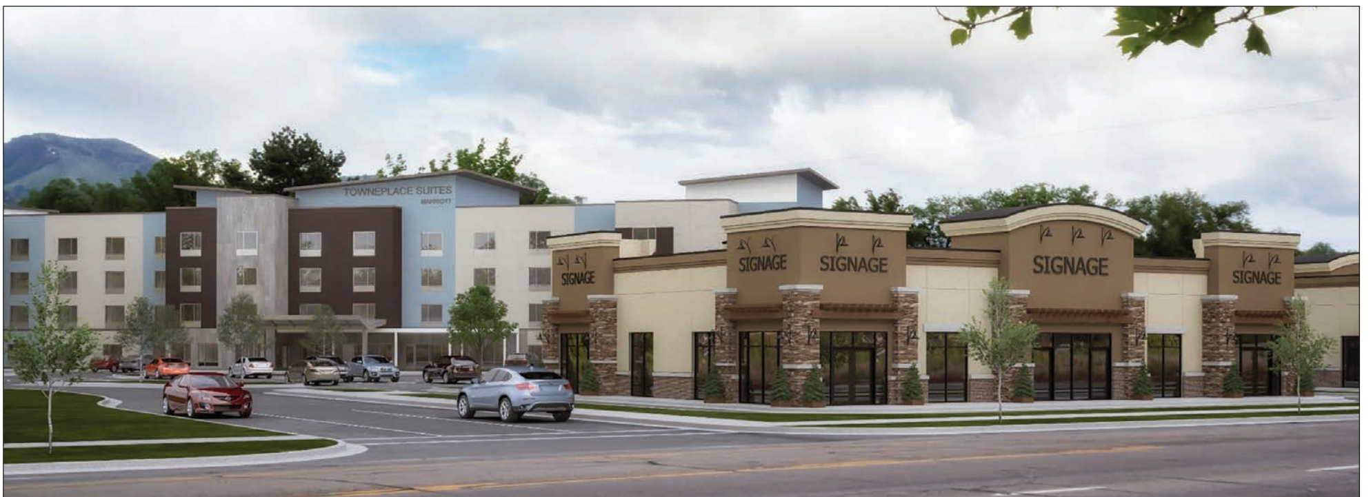
This artist's rendering of the Logan Riverwalk Development shows a concept for a Marriott TownePlace Suites extended-stay hotel and specialty retail shops along Main Street in Logan.