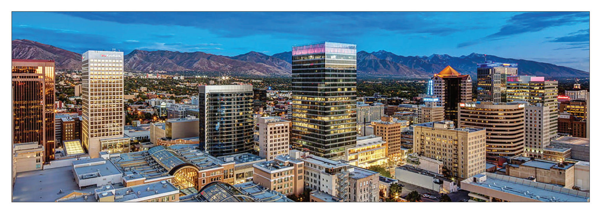
View of the Durham Jones & Pinegar offices in the Salt Lake City skyline.