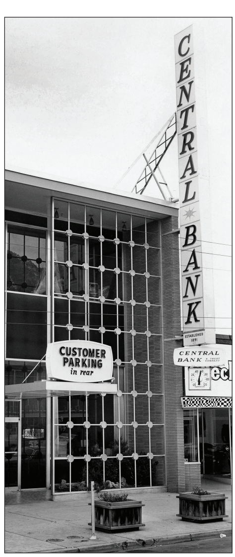
Central Bank in 1966

We are honored to have been able to serve our customers and the Utah Valley community since 1891 and we're excited to continue to provide quality customer service that will benefit our customers in the future.