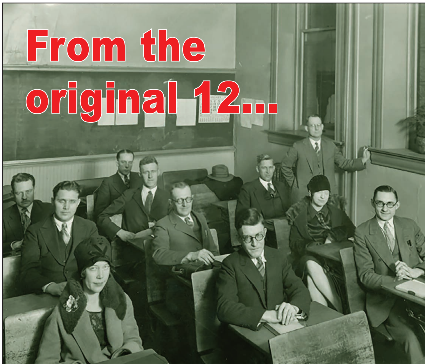
The original founders of University Federal Credit Union meet in a classroom in the Annex Building on the university campus in 1956.