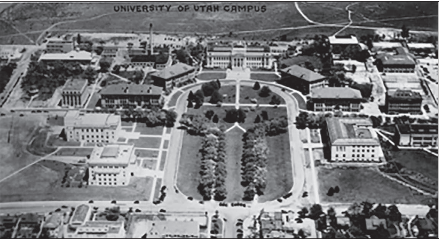
An aerial view of Presidents Circle on the University of Utah campus in about 1956.

The University Credit Union is federally chartered and members’ deposits are insured up to $250,000 per account by the National Credit Union Administration (NCUA), an independent federal agency that supervises and insures federal credit unions.