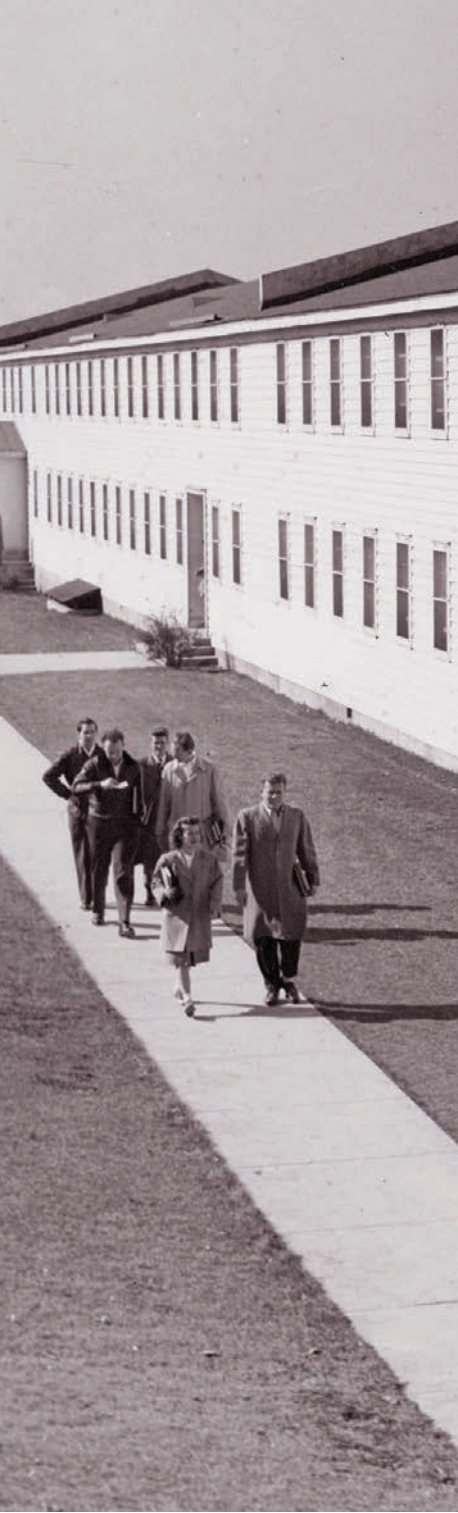
A structure on the University of Utah campus called the Annex Building was the original home of the University Federal Credit Union.