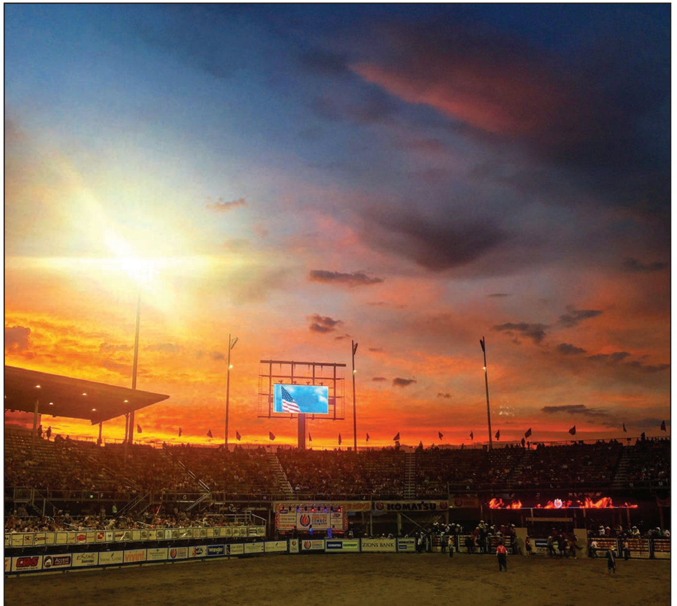
Days of '47 Rodeo Arena at the Utah State Fairpark was built by Okland Contruction and lighted by Cache Valley Electric.

Our people are our power. CVE employees are the best in the industry. Every job is completed on schedule with the highest-quality workmanship. Our strength is in our operations and the people