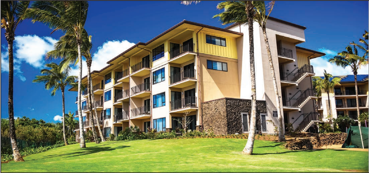
Cache Valley Electric was the electrical contractor at Koloa Landing Resort in Poipu Beach, Kauai, Hawaii, that was built by Layton Construction.

who provide them. We customize solutions to meet each client's needs, honoring a proven commitment to quality, value and customer satisfaction. We are proud of CVE and the work that we do.