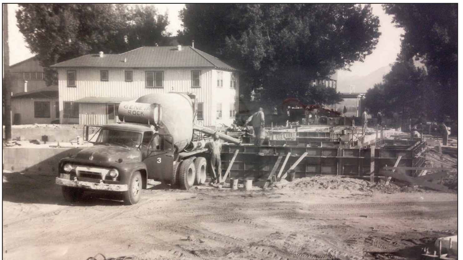
One of the first four mixer trucks for Geneva Rock Products pours concrete on a new home foundation in about 1955.