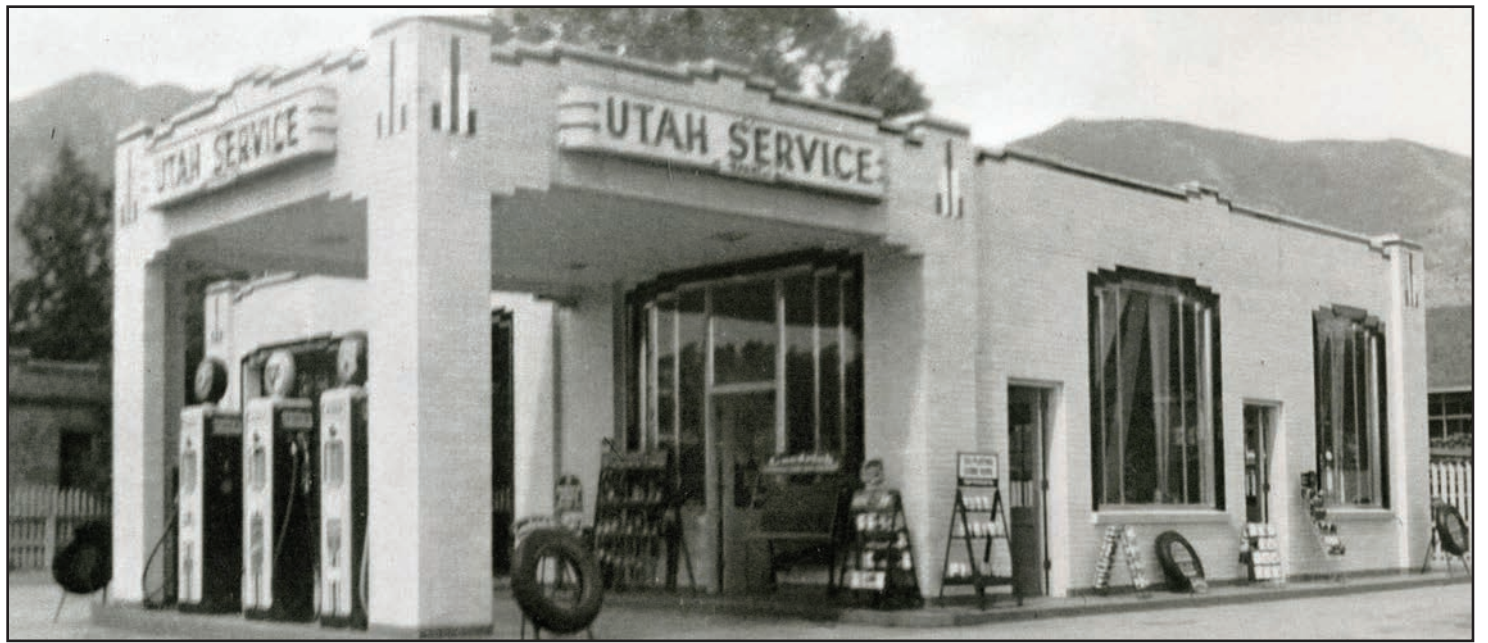
The original Utah Service service station on Main Street in Springville. The company would become Sunroc Building Materials and Sunroc Corporation.

Building a Better Community for over 90 years