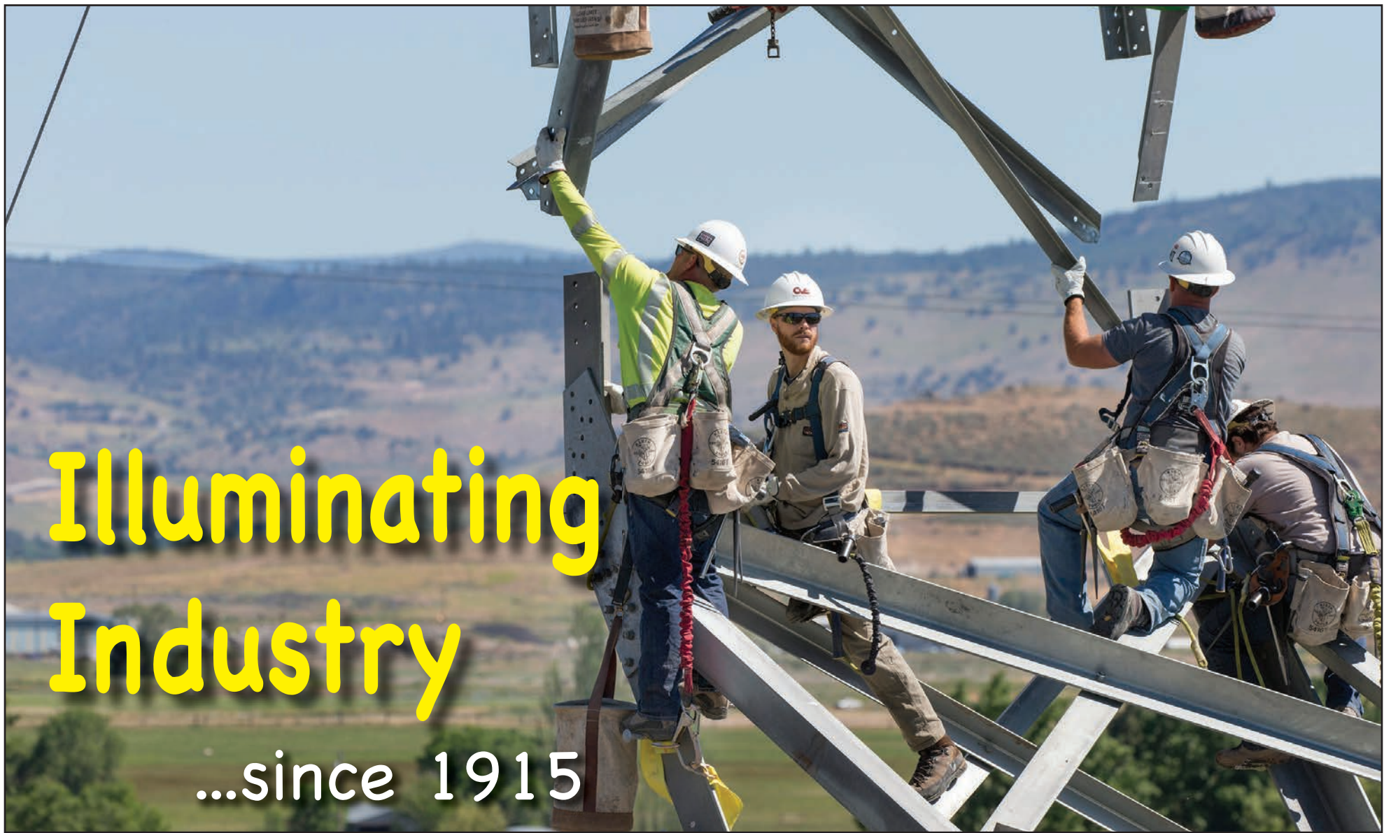
Cache Valley Electric employees work on the Snow Goose Substation near Klamath Falls, Oregon.