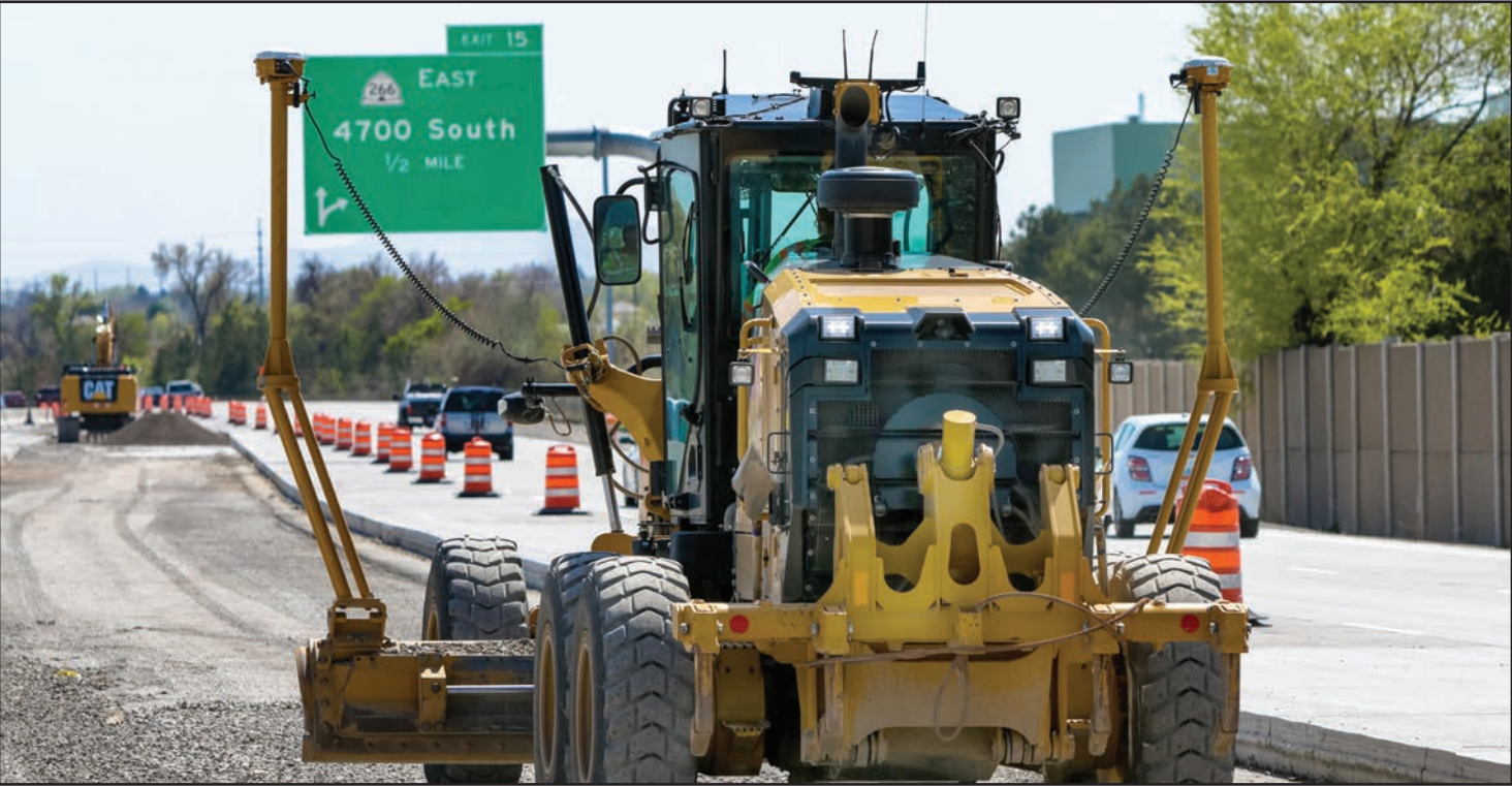
A Staker Parson road grader works an I-215 project in Salt Lake County