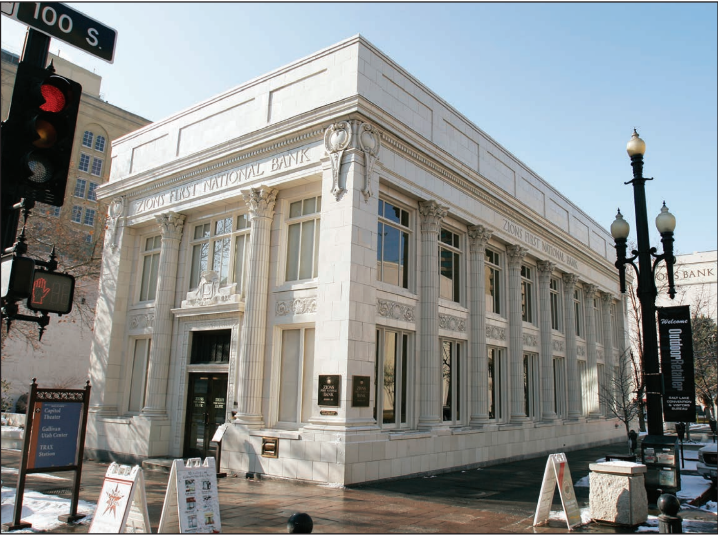
Zions Bank’s historic First South Office has served clients through the generations.

Zions Bank monitors pay equity among employees across the company every six months, analyzing potential disparities in pay based on gender, minority status and other factors. In 2015, Zions Bank became a founding sponsor of a new organization dedicated to enhancing opportunities for women in Utah: The Women’s Leadership Institute. Zions Bank executives