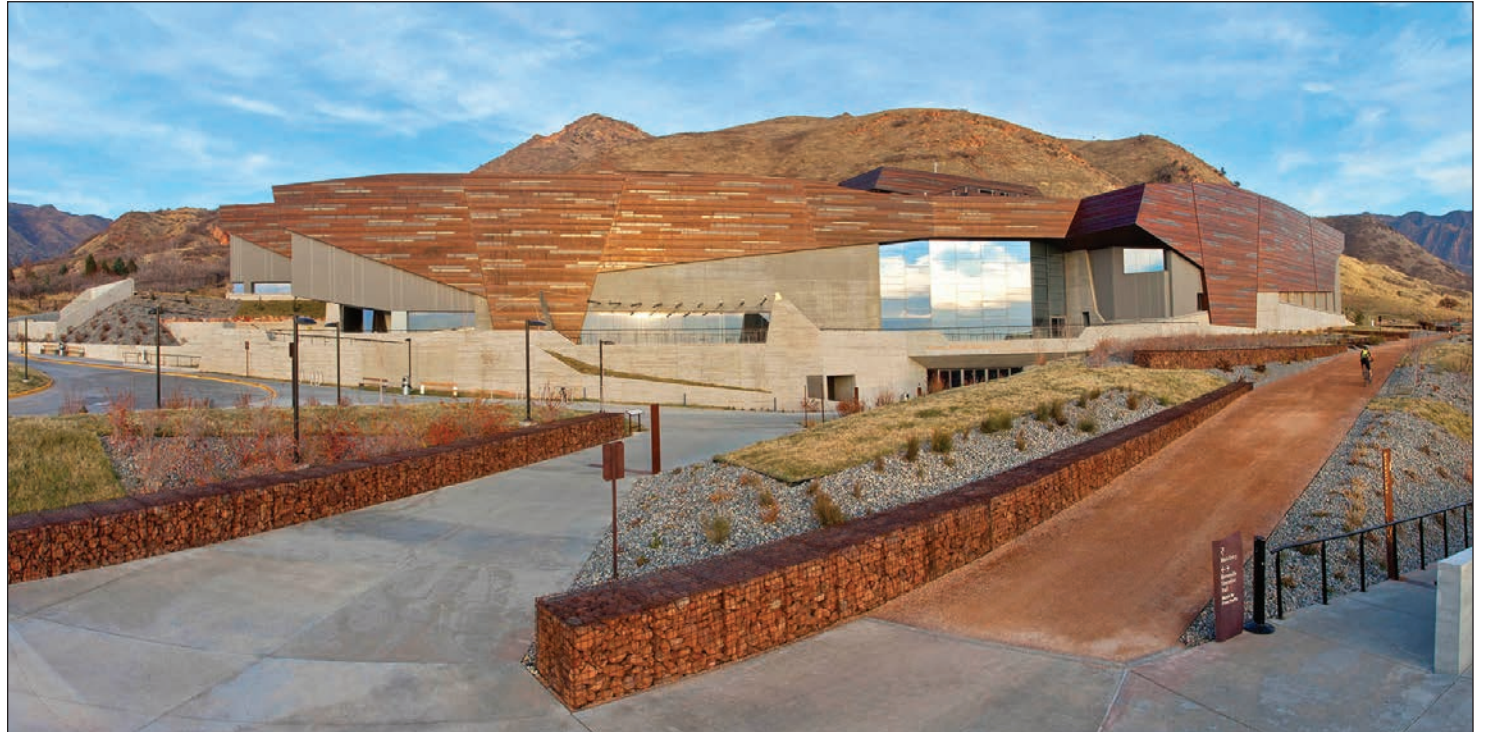
The Natural History Museum of Utah in Salt Lake City