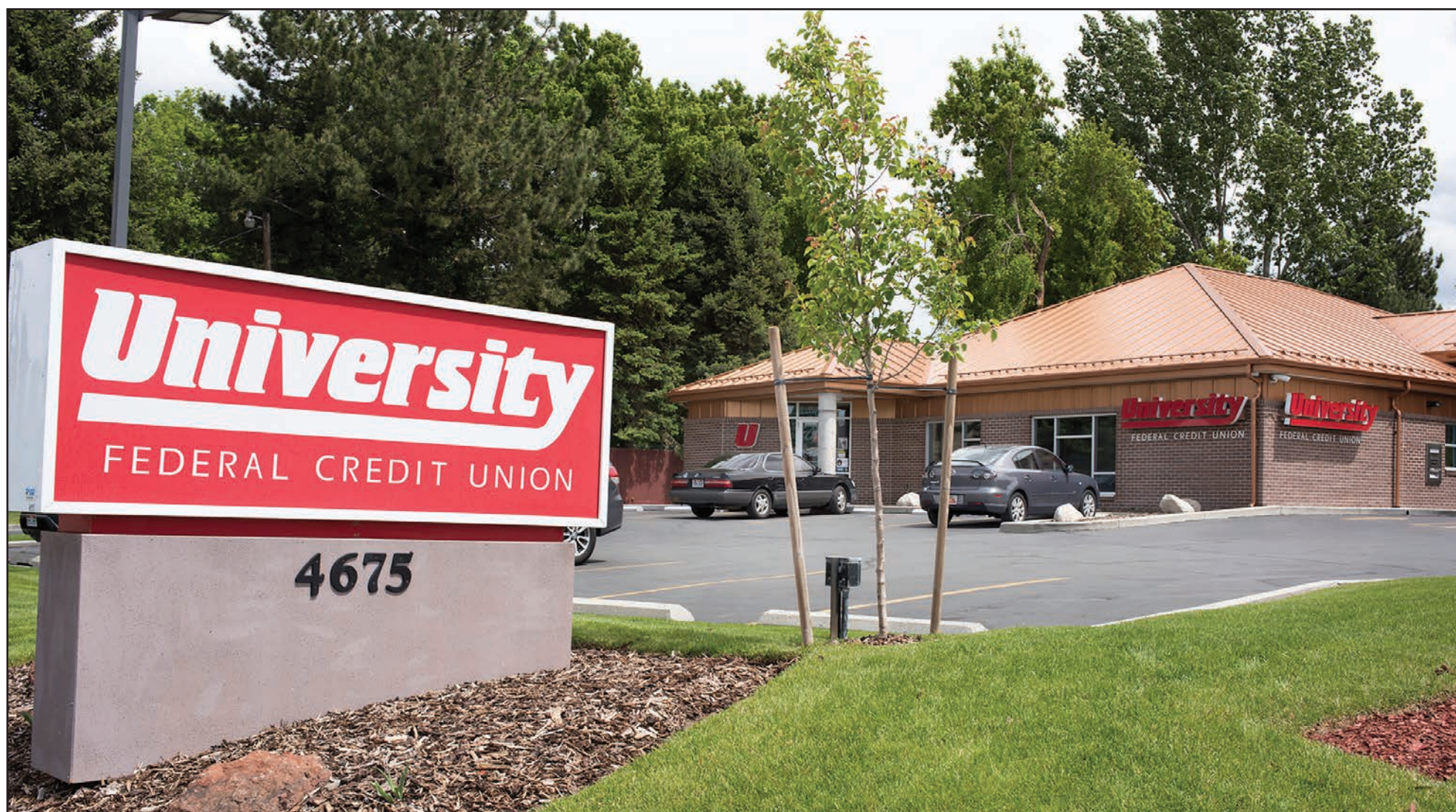
The Holladay Branch of University Federal Credit Union on Highland Drive in Holladay represents the modern offices of the institution.