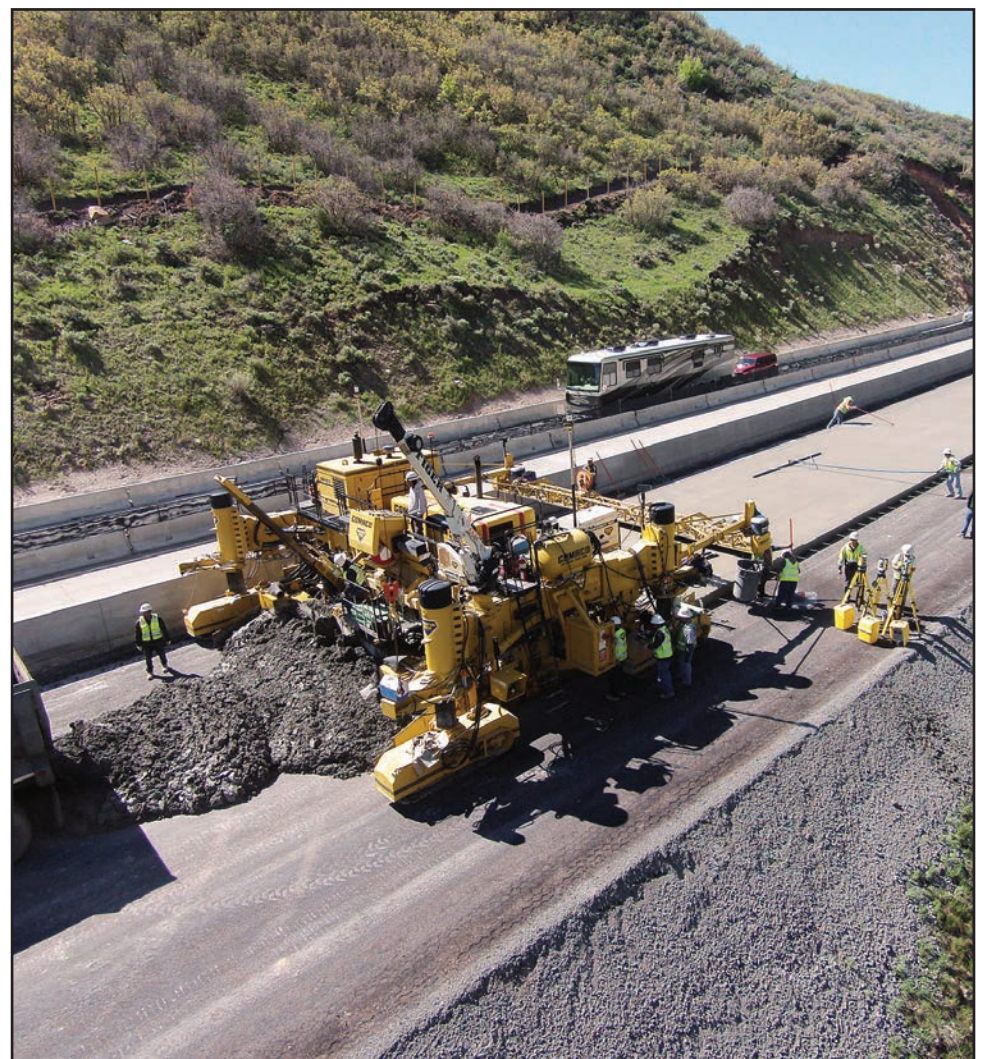
Geneva Rock crews conduct concrete paving on I-80 in northern Utah on the Silvercreek to Wanship project in 2015.