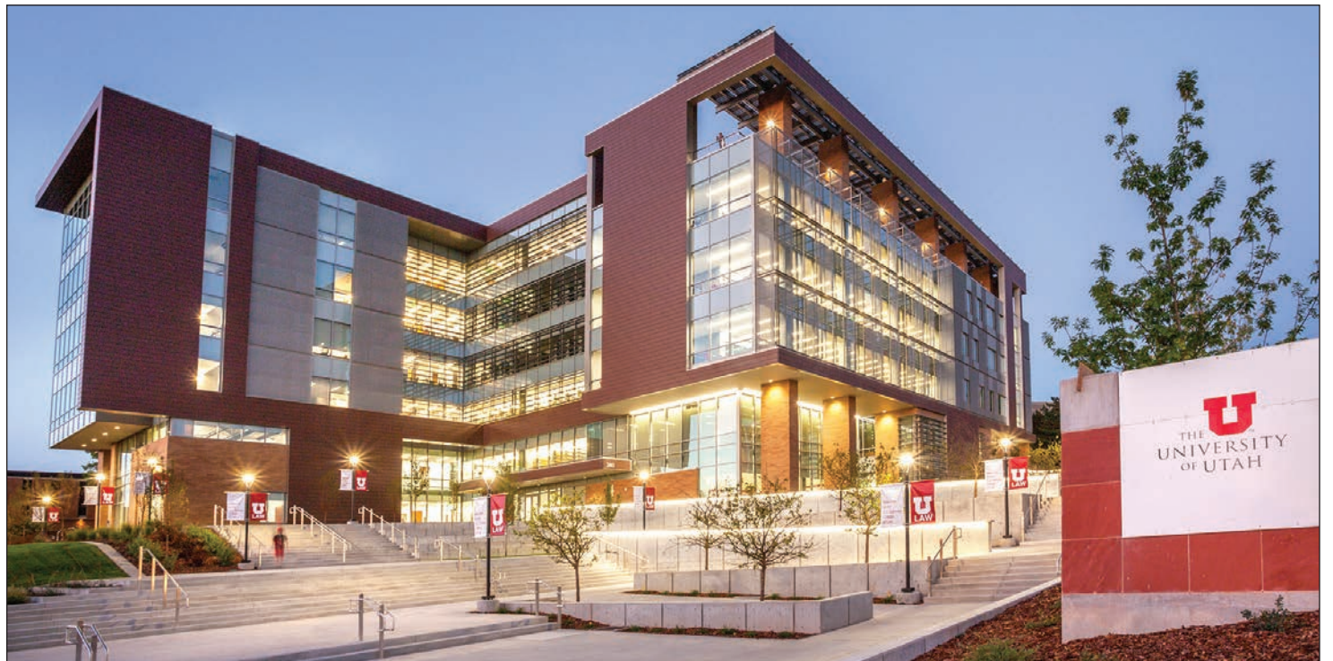
S.J. Quinney College of Law at the University of Utah