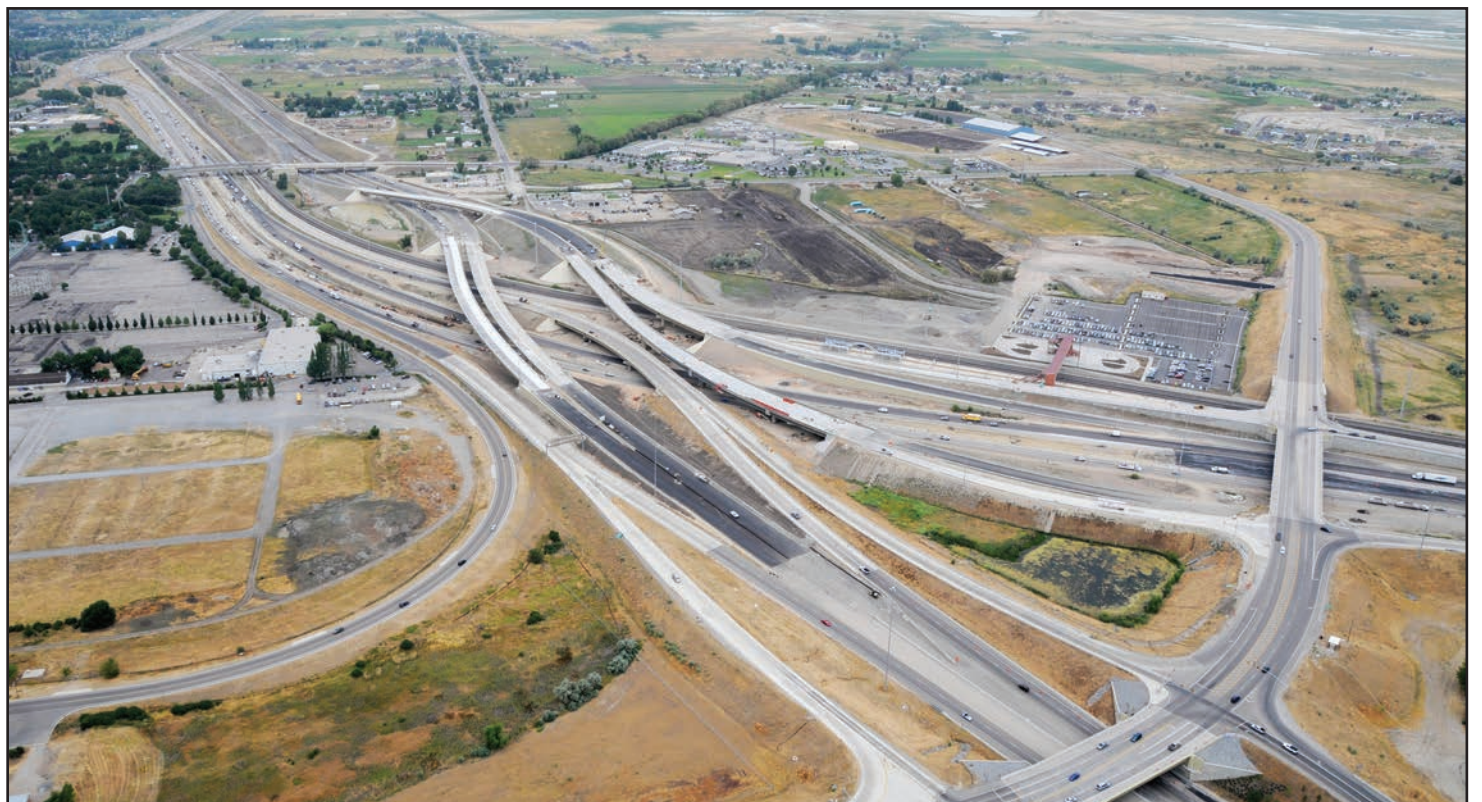
Aerial of the “Wasatch Weave” interchange on the Legacy Highway project constructed by Clyde Companies in 2008.

Clyde Companies’ goal is, and always has been, to “Build a Better Community.”