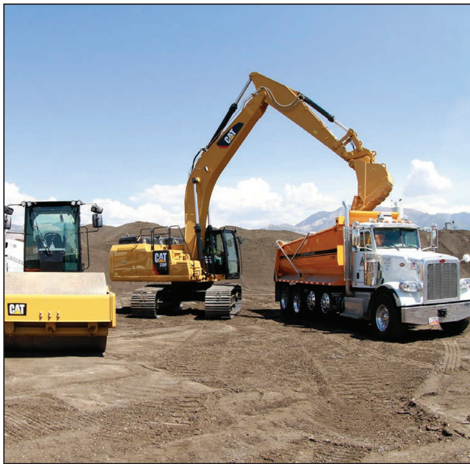
Staker Parson Companies, Ogden, Utah

What does it mean to be The Preferred Source ? To Staker Parson Companies, it means creating innovative products and solutions. It means safely building projects of the highest quality. It means developing and training employees. It means a quality and timely delivery with every load of material. It means supporting and giving back to the community. In short, it means award-winning safety, quality, service and innovation for over 65 years and looking forward to many more.