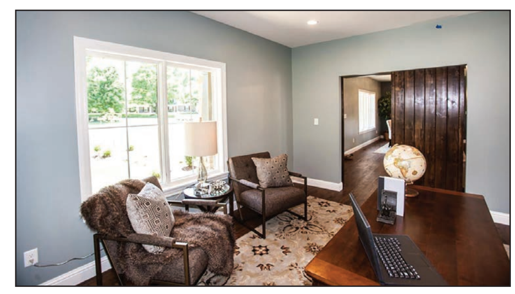
As lifestyles change, home offices are now an essential part of most custom home designs.