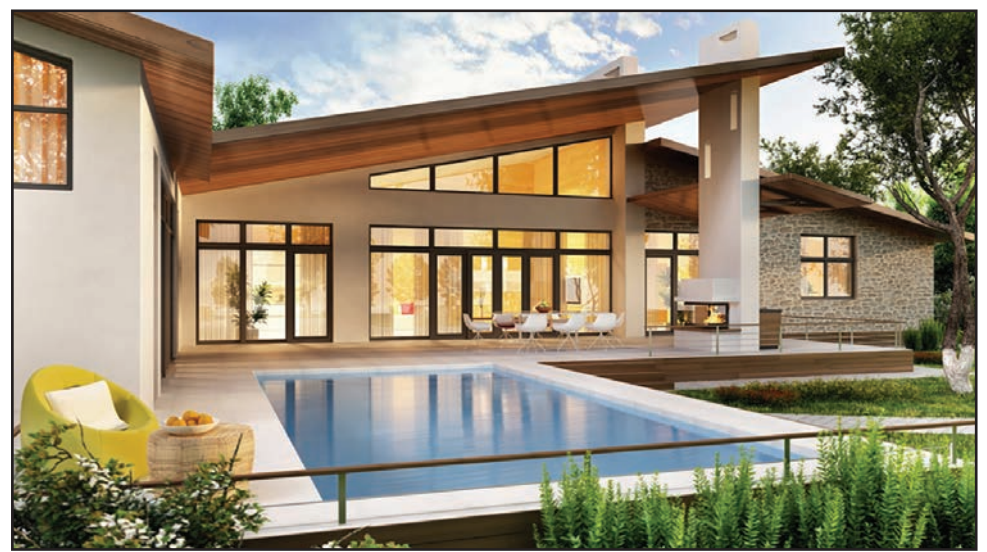
At home recreation has grown in importance for our clients as more evenings and weekends are spent at home with family.