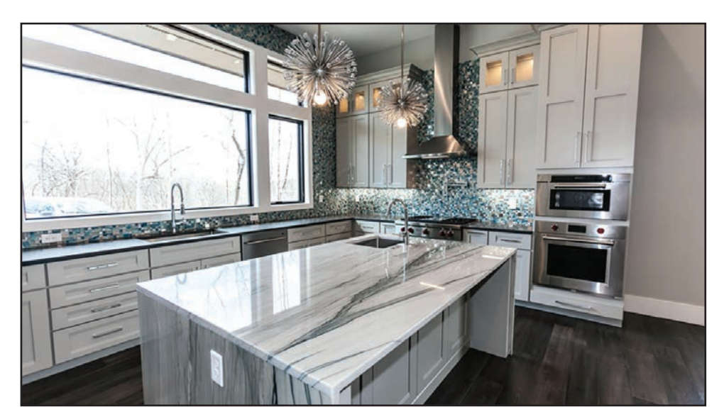
Custom kitchens have always been a must-have, and with more time at home they are becoming a reason more people are turning to custom home building.